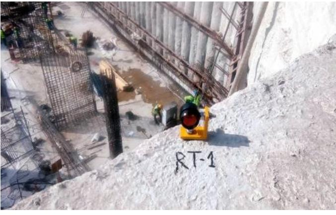
system to the Contractor, Client as well as the Consultant on their desktops.